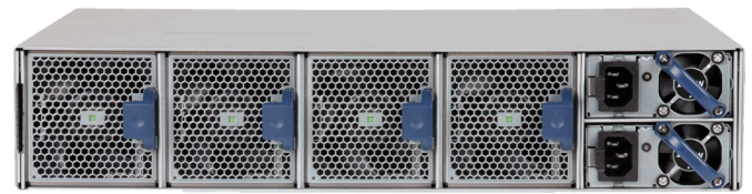
Arista 7050X 2RU Rear View: Rear-to-front airflow model