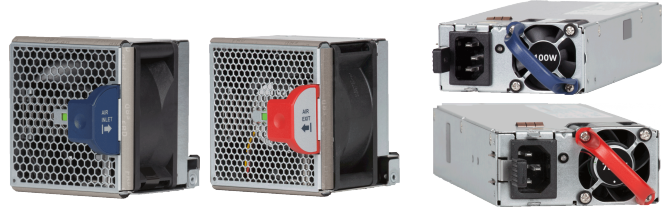
Arista 7050X hot swap and reversible fans and power supplies