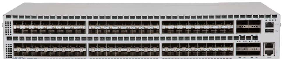
Arista 7050SX-128: 96x 10GbE SFP+ and 8x 40GbE QSFP+ ports

Combined with Arista EOS the 7050X Series delivers advanced features for big data, cloud, virtualized and traditional designs.